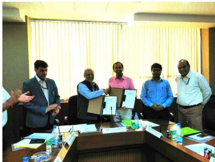
Signing of MOU between AICTE and Internshala on 27-04-2017 at AICTE Headquarters, New Delhi