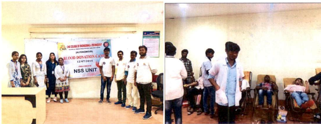
NSS volunteers in blood donation camp