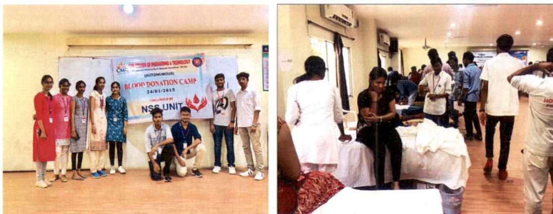
NSS Volunteers and students in Blood Donation Camp