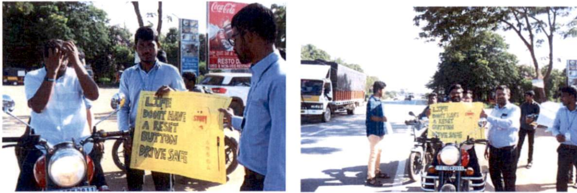
NSS Volunteers and students are campaign at national Highway and Medchal Junction