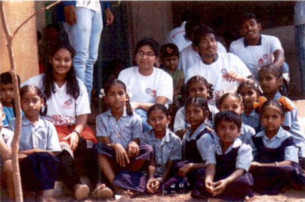
NSS Volunteers with dropout children's at Bachrajpally