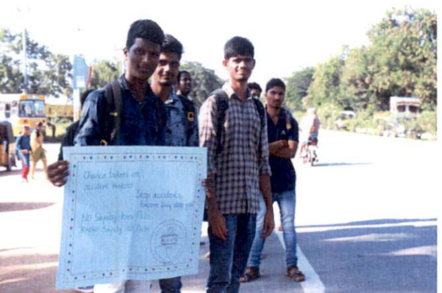
NSS Volunteers and students in Traffic Awareness Camp