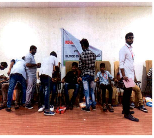
NSS Volunteers and students in blood donation camp