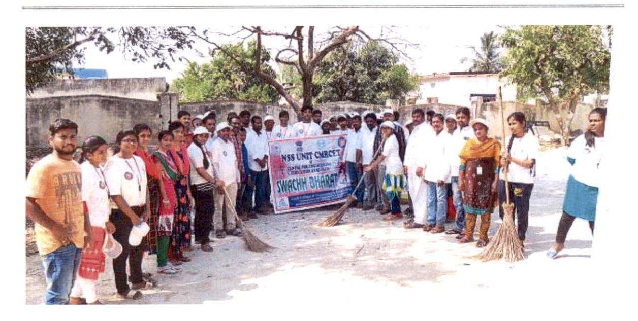
NSS volunteers and students in Swachh Bharat program

An Autonomous Institution with NAAC Accreditation (A Grade) *Approved by AICTE *Permanently affiliated to JNTUH *NBA Accreditation Kandlakoya (V), Medchal Road, Hyderabad -501401.