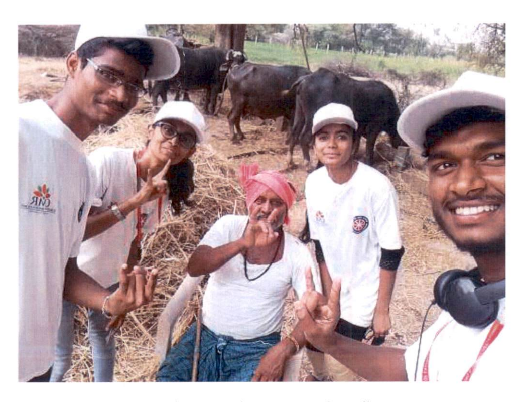
NSS volunteers and mentors at puduru village

An Autonomous Institution with NAAC Accreditation (A Grade) *Approved by AICTE *Permanently affiliated to JNTUH *NBA Accreditation Kandlakoya (V), Medchal Road, Hyderabad -501401.