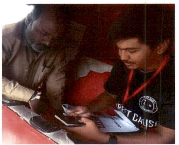
NSS volunteers and students in Digital Transactions