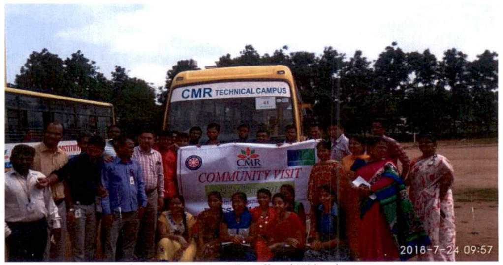
Community visit with staff and NSS volunteers

Community Visit program actively connects grassroots community building efforts in towns across Vermont with state-wide resources, expertise and opportunities. Each Visit brings together a broad mix of community members with a visiting resource team, made up of Council members and statewide providers (state, federal, non-profit, and philanthropic), to create intensive partnerships and tailored work plans for long-term local success. The Visit process is designed for community members to prioritize and choose strategic goals and vision for their community and for the state-wide visiting resource team to provide advice and expertise to help them get there. The program takes place over four months with a series of public meetings, facilitated discussions and community events. To be successful, a broad spectrum of community members must be involved; invitations sent through schools, businesses, and through town offices to residents are very important.