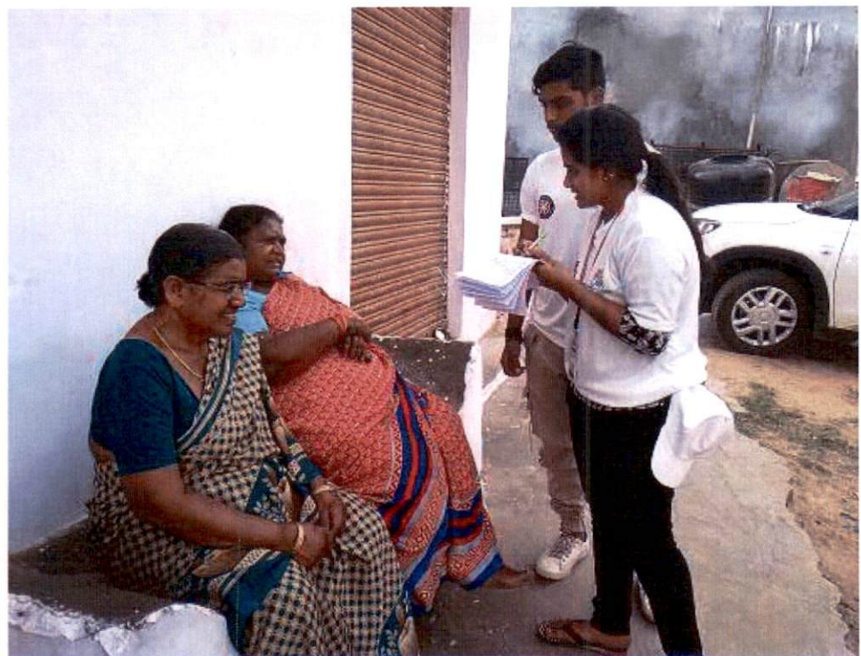
NSS volunteers and students in awareness on dowry prohibition at Rajbollaram village